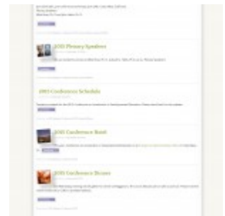
2015 conference article section