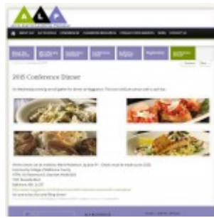
Conference dinner page