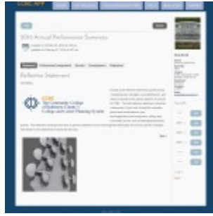
Sample web view of an Annual Performance report