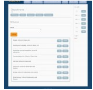
Administrator screen – departments