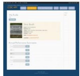
“My profile” page with user information and the list of reports