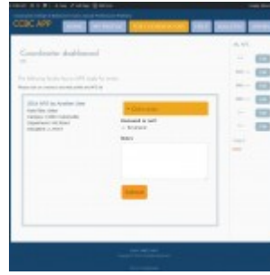
Coordinator dashboard with reports ready for review