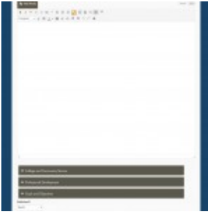
Easy Annual Performance form