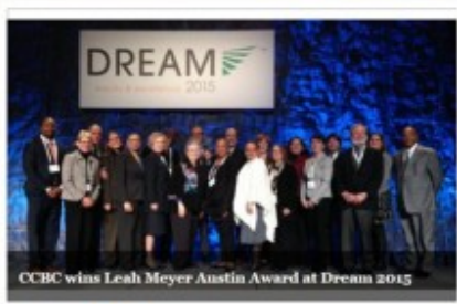
CCBC wins Leah Meyer Austin Award at Dream 2015