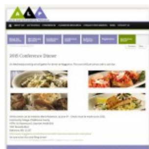
Conference dinner page