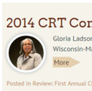
CRT-CC List of articles

This is a WordPress based website with a simplified and proofed back-end and admin flow for ease of use by non-technical users.