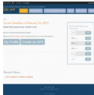
APP Homepage after signing in