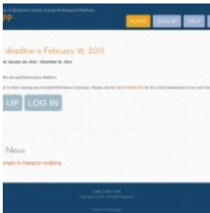
APP Homepage before signing in