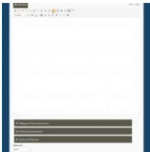
Easy Annual Performance form