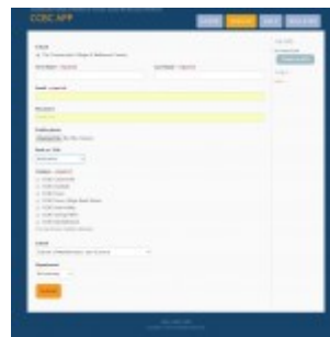
Sign up page