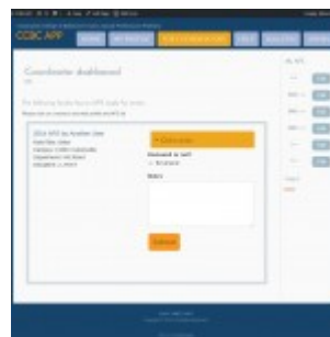
Coordinator dashboard with reports ready for review