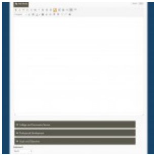
Easy Annual Performance form