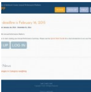
APP Homepage before signing in