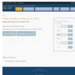
APP Homepage after signing in