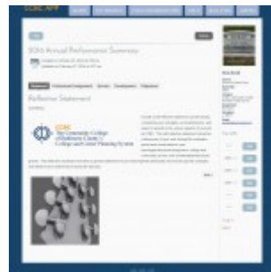
Sample web view of an Annual Performance report