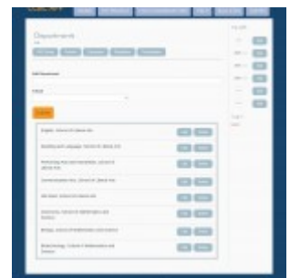
Administrator screen – departments