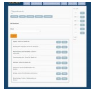
Administrator screen – departments