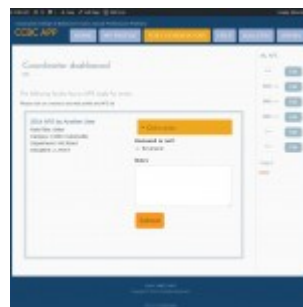
Coordinator dashboard with reports ready for review