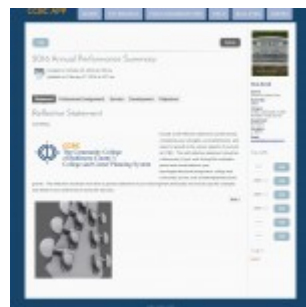
Sample web view of an Annual Performance report